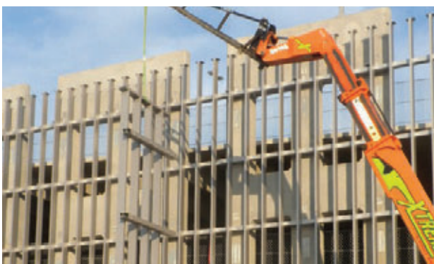
Figure 22: Kaiser Permanente Health at Washington Hospital, Washington, DC

Another parking structure, Democracy Tower in Reston, VA (Figures 25 & 26) had similarly repetitive panels, making off-site assembly more efficient for installation. This crew hung 20 units a day with seven panels on each assembly.