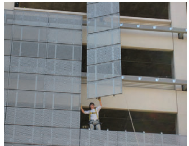
Figure 25: Democracy Tower, Reston, VA