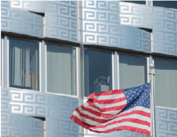
Figure 6: Curved SS Spandrel assemblies and mullion covers

the Metalwërks facilities to enable more efficient on-site installation. Interestingly, urban logistics played a key role in this unitization decision: Access from over an existing plaza with finished landscaping made it an imperative to hoist the units from the flat bed parked in the street. They were then hung in place from a crane located across the street.