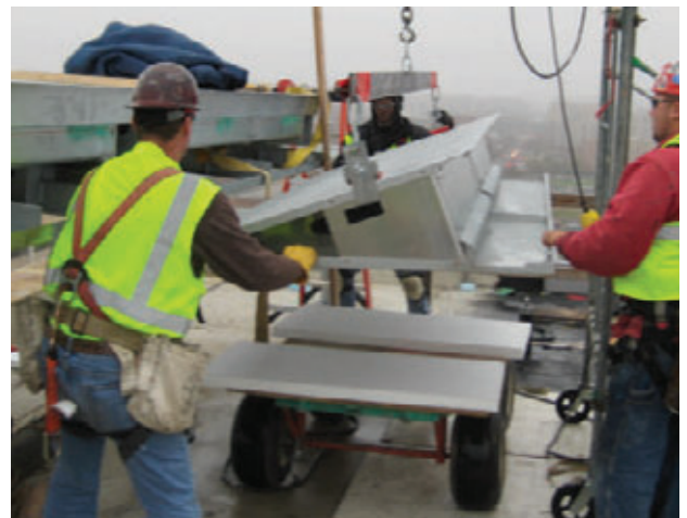
Figure 12: Lifting the unit