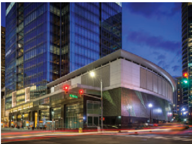
Figure 21: Shop assemblies awaiting truck loading for site delivery to 1812 North Moore in Arlington, VA