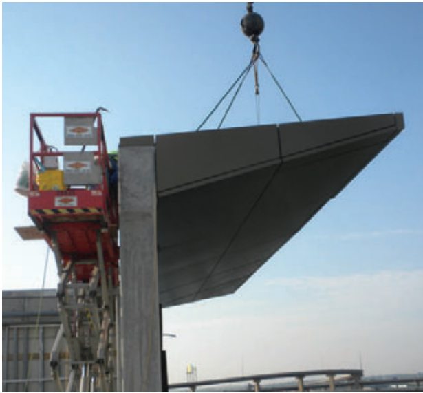
Figure 2: Setting the pre-assembled cornice units onto engineered hook cleats.

If all the construction workers responsible for all the different components had to individually rig and install their work while they were hanging out in space, and simultaneously try to maintain some semblance of a coordinated sizing and location tolerance, the job would have become unnecessarily complex. As a viable solution, Metalwërks pre-assembled all the internal supports and building components necessary to create a complete assembly with more exacting shop-controlled tolerances. This was then simply installed by a crew of three workers using a boom truck. (Figure 2)