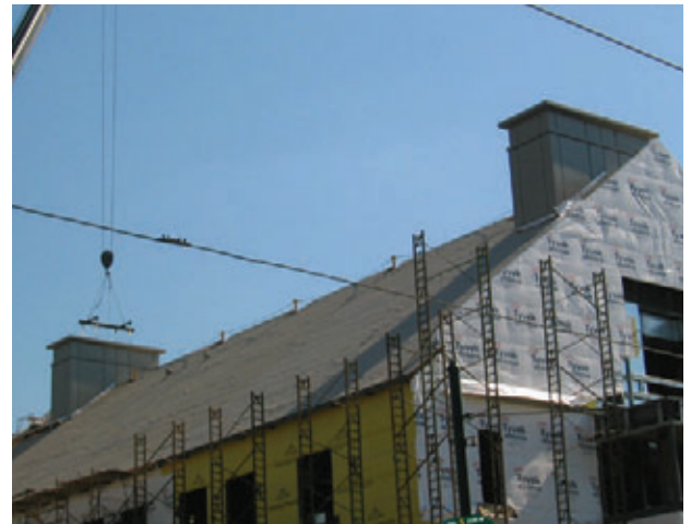
Figure 18: Final placement onto the preset curbs