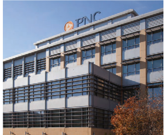
Figure 7: PNC Bank First Side Center