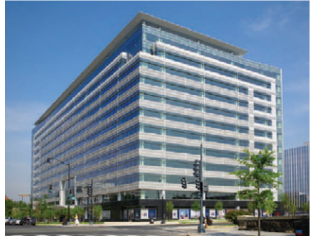
Figure 11: 90 K St NW - Washington, DC

both presented this scenario. Here, the roof-mounted canopy features posed a rigging risk due to overhang conditions.