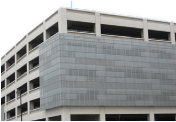
Figure 26: Democracy Tower, Reston, VA

Many small, custom-shaped panels were pre-assembled into larger assemblies so the installation costs and tolerance accumulation could be better managed. This installation was reduced from hundreds of small shaped panels into dozens of manageably sized assemblies. Headers, cornice projections, spandrels, and pilasters were all preassembled in the shop after finishing.