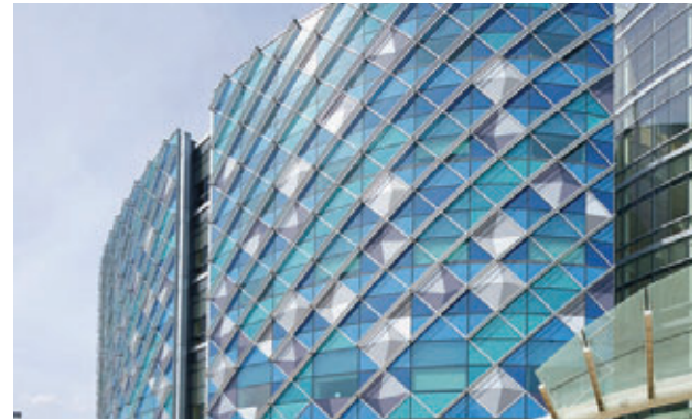
Figure 4: Al DuPont de Nemours Children's Hospital - Unitized Curtain wall with 3D alum plate spandrel infills.

At the Alfred I. duPont Nemours Hospital for Children (Figure 4), Metalwërks developed the means and methods to provide multiple colors on a singular .125 aluminum panel assembly for unitization into the Oldcastle Curtainwall system. The visual effect is truly three dimensional given the 2D flat panel design which required panel seams to be virtually invisible. The design required multiple colors to be installed in the curtainwall system to appear like a pyramid, or present a prism effect when finished and glazed. Six separate colors were used in varying silver, grey, and blue tones to complement the blue/green tones of the glass panels and utilize similar geometry.