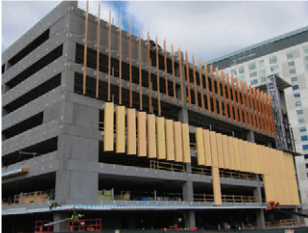
Figure 9: South Boston Waterfront Transportation Center Parking Garage