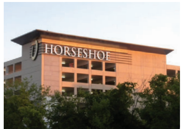
Figure 1: Horseshoe Casino Parking Structure, Baltimore, MD

The cornice feature in the Horseshoe Casino (Figure 1) was a particularly complex situation where unitization was key. In this design, the architect showed a series of sub-components including miscellaneous iron supports bolted to the cast-in-place concrete frame, studs, sheathing, and a waterproofing membrane on an overhanging feature that was 60' above finish grade.