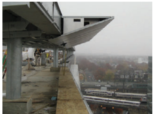
Figure 13: In place unit