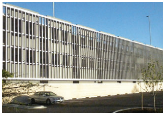
Figure 24: Kaiser Permanente Health at Washington Hospital, Washington, DC