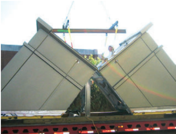
Figure 15: Custom hinged rigging enables units to be shipped flat

A similar issue arose at the University of Science and Technology, Philadelphia, PA (Figures 15-18). Due to the severe roof pitch, the decision was made to avoid multiple trades working over the sloped roof and to pre-assemble studs, sheathing, AVB, and panels at Metalwërks' Elkton Facility.