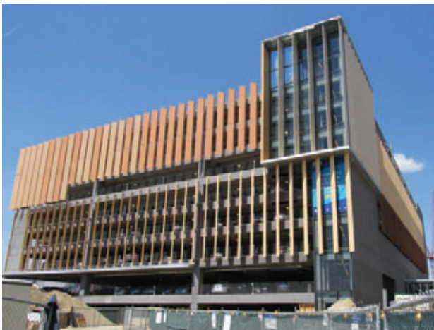
Figure 10: South Boston Waterfront Transportation Center Parking Garage