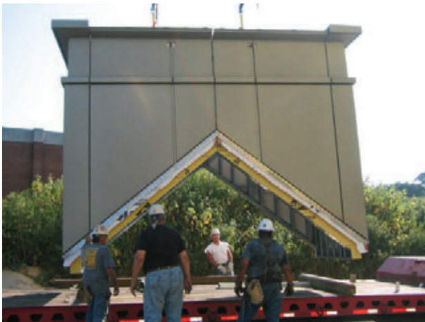
Figure 16: Units hinge together and are bolted prior to hoisting - Clamshell method used to avoid low overhead trolley lines.