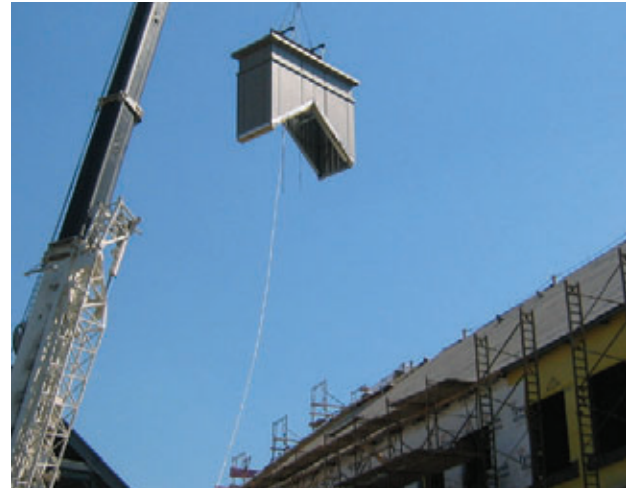
Figure 17: Hoisting the units into place