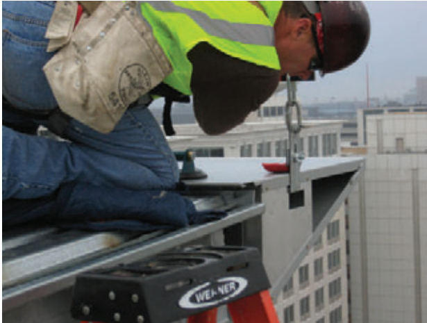
Figure 14: No he's not using his teeth. Even we can't make it that easy.

A similar issue arose at the University of Science and Technology, Philadelphia, PA (Figures 15-18). Due to the severe roof pitch, the decision was made to avoid multiple trades working over the sloped roof and to pre-assemble studs, sheathing, AVB, and panels at Metalwërks' Elkton Facility.