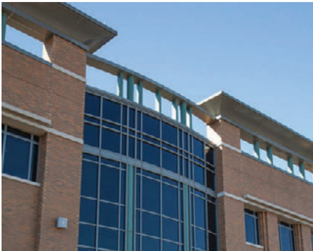
Figure 3: Hillman Cancer Ctr - Pittsburgh, PA

With the Hillman Cancer Center project, (Figure 3) a similar set of conditions were created by the design of a complex overhanging cornice. Metalwërks took control of the entire feature by shop-assembling and integrating all of the internal supports necessary to create the shape and also to resist all of the structural loads. Loose attachment clips were provided to the installer, and each assembly was key-coded for its specific location in the cornice sequence.