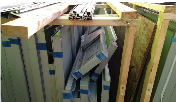
Figure 4: Improper handling of a finished panel. Never leave panel faces unprotected in storage.

When handling the panels, care should be taken so that the finish is not scratched or scuffed. The daily use of clean cotton gloves is recommended and when handling stainless steel panels, Tyvek® protective gloves are recommended. Panels should be carried with the attachment legs oriented skyward in the same manner as they were crated. A handling plan should be discussed with your Metalwörks representative for some of the more fragile, shaped panels. Many panels can be damaged or racked out of tolerance when subjected to careless handling.