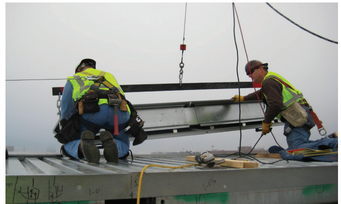
Figure 6: Unitized cornice assembly: Hoisted using wire slings slung through unfinished framing sections inside the unit.