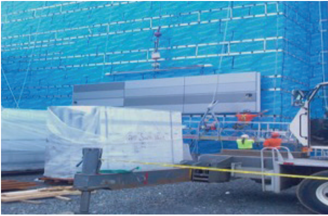
Figure 3: Metalwörks crated wall panels- properly stored awaiting installation