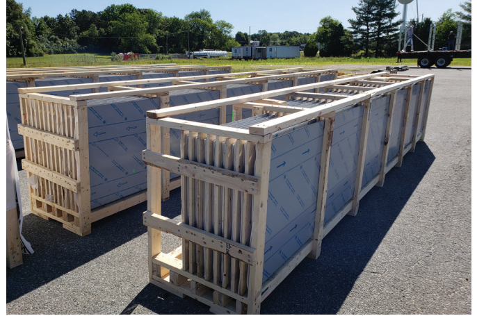
Figure 1: Standard crating of Stainless Ameriplate wall panels

Special crating can be arranged with your Metalwërks PM or project engineer. Be sure to mark up your project-specific packaging needs on a set of Metalwërks shop drawings for clarity of communication. See image of a typical crate in Figure 1: